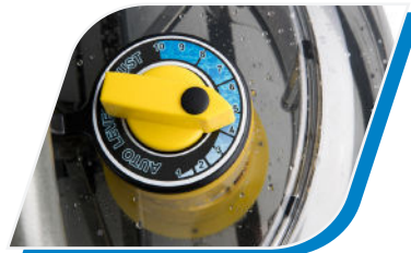
10 LEVELS OF RESISTANCE