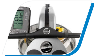
COMFORTABLE HANDLE DESIGN