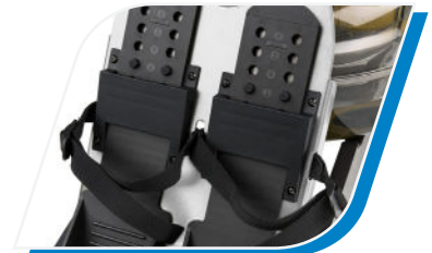
ADJUSTABLE FOOT PEDALS

The SPIRIT Fitness CRW900 Rower brings the timeless tradition of rowing into the gym. The highlight of this machine is its distinctive water tank which provides up to 10 challenging levels of resistance with a simple turn of a knob. The console features a large 5.5" easy-to-read display with 5 pre-programmed workouts to keep athletes engaged. The wooden and steel frame features smooth slide rails, an ergonomically molded seat, and commercial-grade padded handlebar that deliver the ultimate combination of quiet, smooth, and reliable performance.